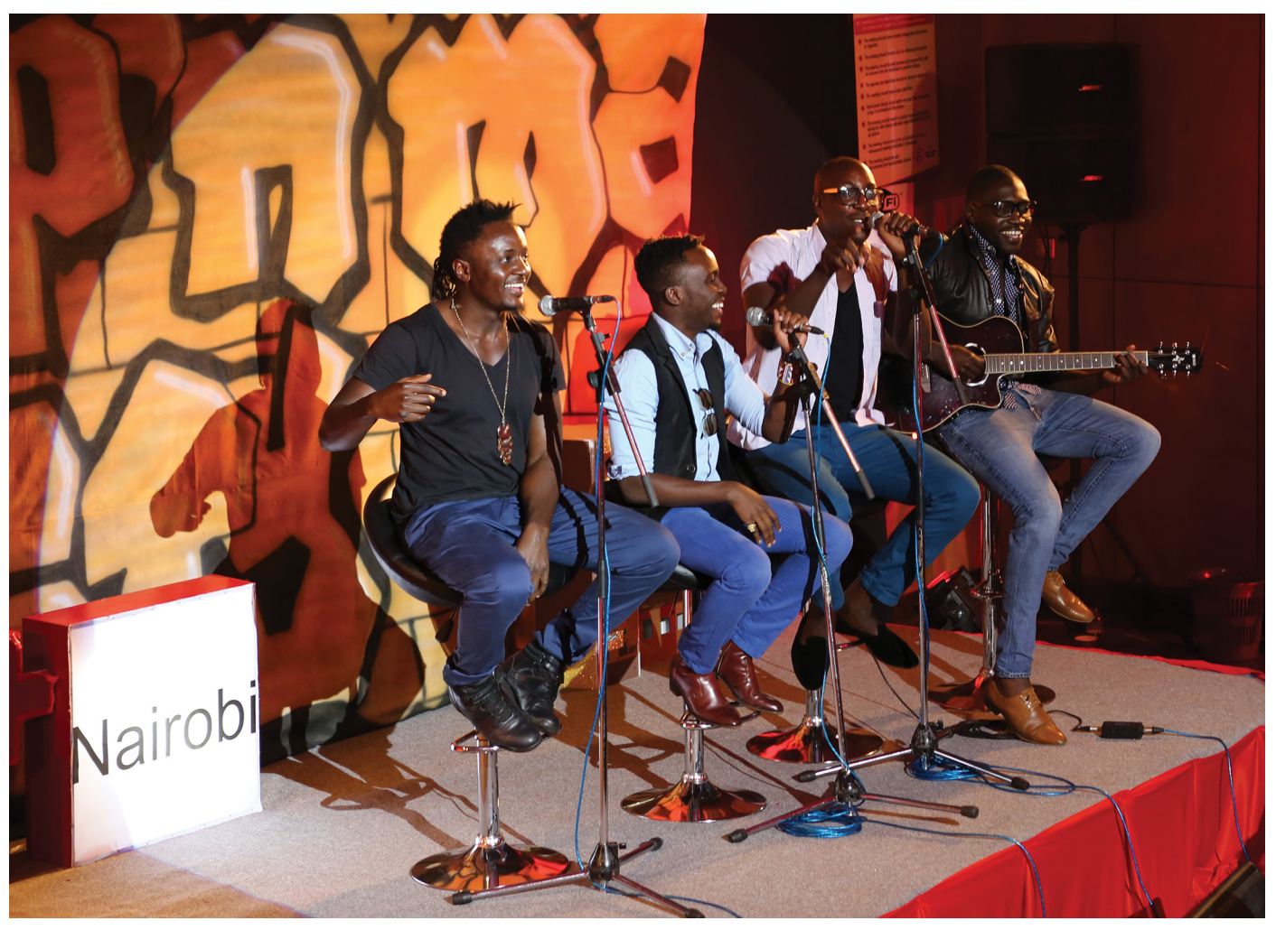
East African music group Sauti Sol perform at TEDxNairobi in October 2013. African music and creative industries have seen a big boom in recent years, even beginning to reach audiences in the United States.

Africa League (BAL), its first professional league outside of North America, launching in May 2021 after a delay due to the coronavirus pandemic.