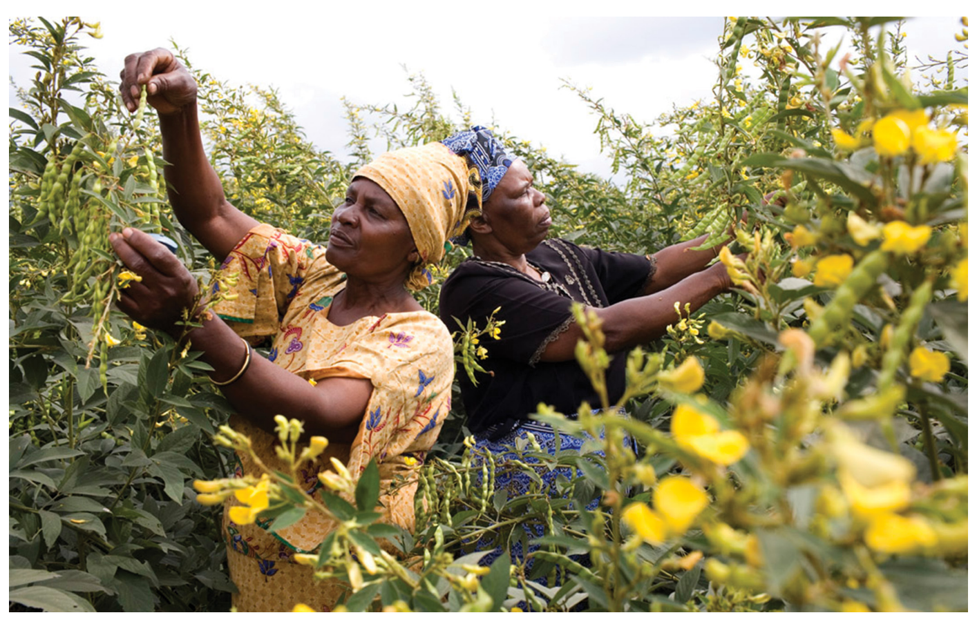
Women inspect pigeonpea at flowering time in East Africa.

competitive globally vis-à-vis China, it will need to support a range of investment opportunities and bring America's small and medium enterprises (SMEs) into the fold.