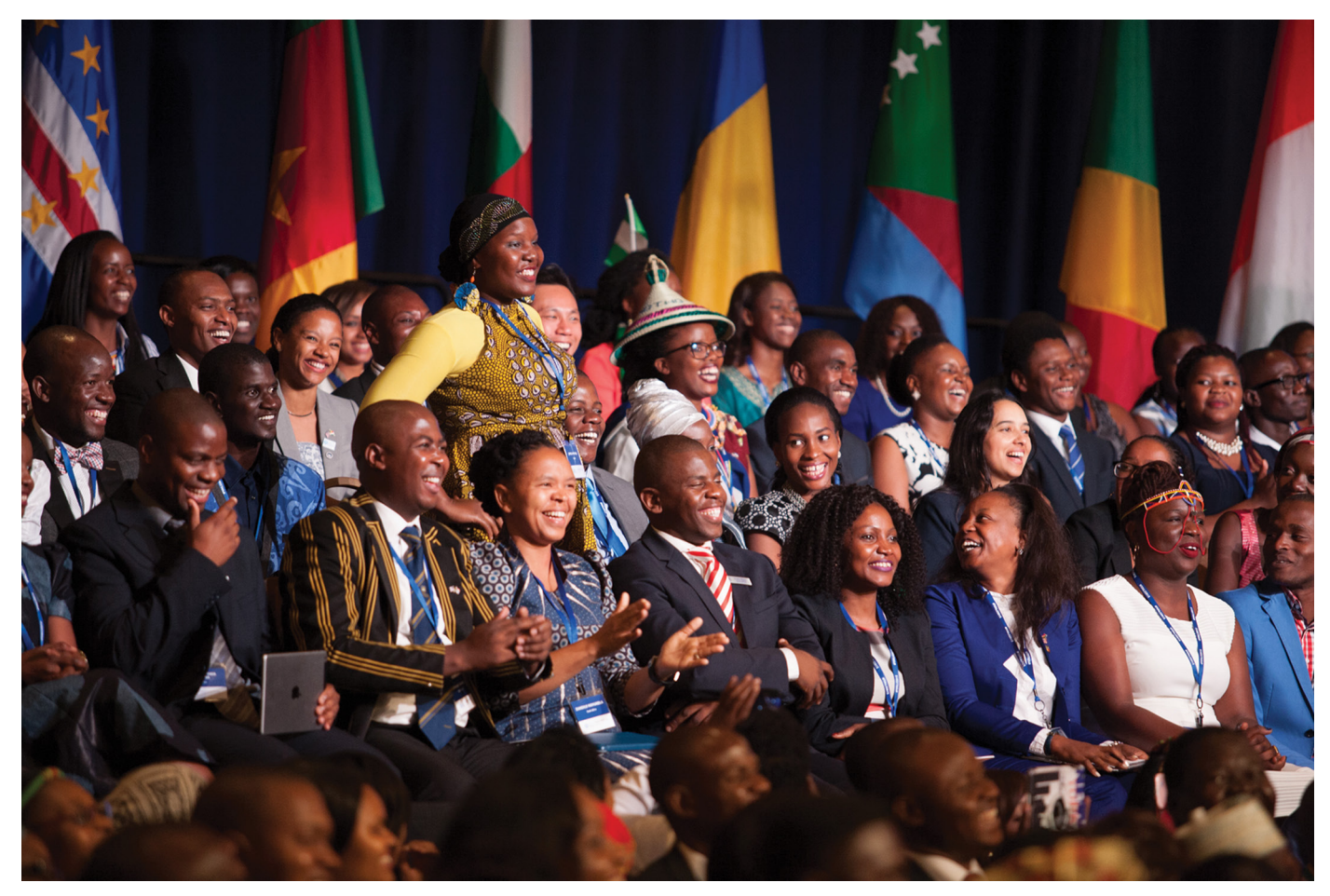
Participants at the Young African Leaders Initiative (YALI) 2015 Presidential Summit in Washington, DC.

than from any other country.<sup>45</sup> The Biden administration has taken an important first step by involving people of African descent in US policy making through various administration appointments, including as co-lead for international development on the transition team, the acting director of the US Trade and Development Agency (USTDA), and the deputy secretary of the Treasury. He also rightfully ended Trump's travel ban largely targeted at Muslim-majority and African countries, once again providing the opportunity for legal migration to the United States.<sup>46</sup> These early successes can be built upon and institutionalized.