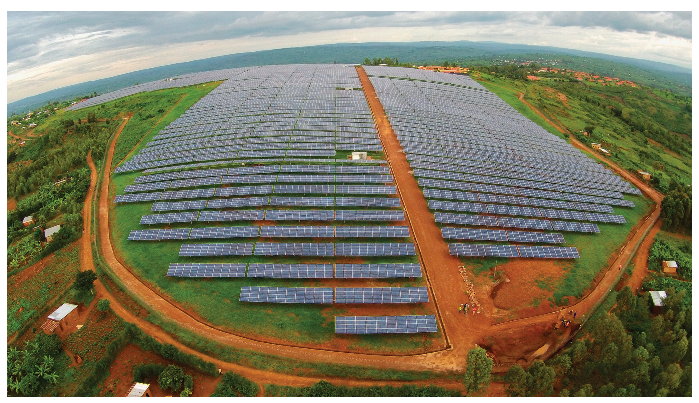
A $23 million project, the solar field at the Agahozo Shalom Youth Village outside of Kigali, Rwanda, was the first utility-scale, grid-connected, commercial solar field in East Africa.

drive innovation and scale up efforts in green investing, the DFC board and incoming chief executive officer should appoint a head of climate finance to engage with Kerry's international climate team and lead the agency's efforts to mobilize US capital for green projects in emerging markets. This approach is similar to the 2X program launched at OPIC (now the DFC) in 2018 to mobilize investments toward addressing the unique challenges women face globally in accessing finance and is led by a managing director.<sup>65</sup>